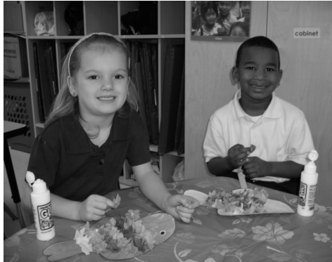
Teacher Grant-The World is a Rainbow—Coteau Bayou Blue School

Memorial or Honorarium Giving. Memorial gifts celebrate the memory of deceased family and friends. Honorariums acknowledge someone for a special occasion. Memorial and Honorarium gifts will be placed in the endowed fund.