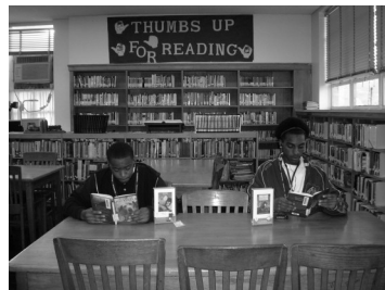
School Impact Grant-Readaway With Playaway- Houma Jr. High

*Annually visit with school faculties and host grant workshops to encourage educators to participate in the grant process.